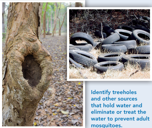
Identify treeholes and other sources that hold water and eliminate or treat the water to prevent adult mosquitoes.

The treehole mosquito life cycle is centered around standing water that accumulates in holes in the trunks and branches of trees, or in artificial containers and tires. A wide variety of trees are commonly used by treehole mosquitoes, with oaks, bay, walnut and eucalyptus being the most common due to the high tannin levels.