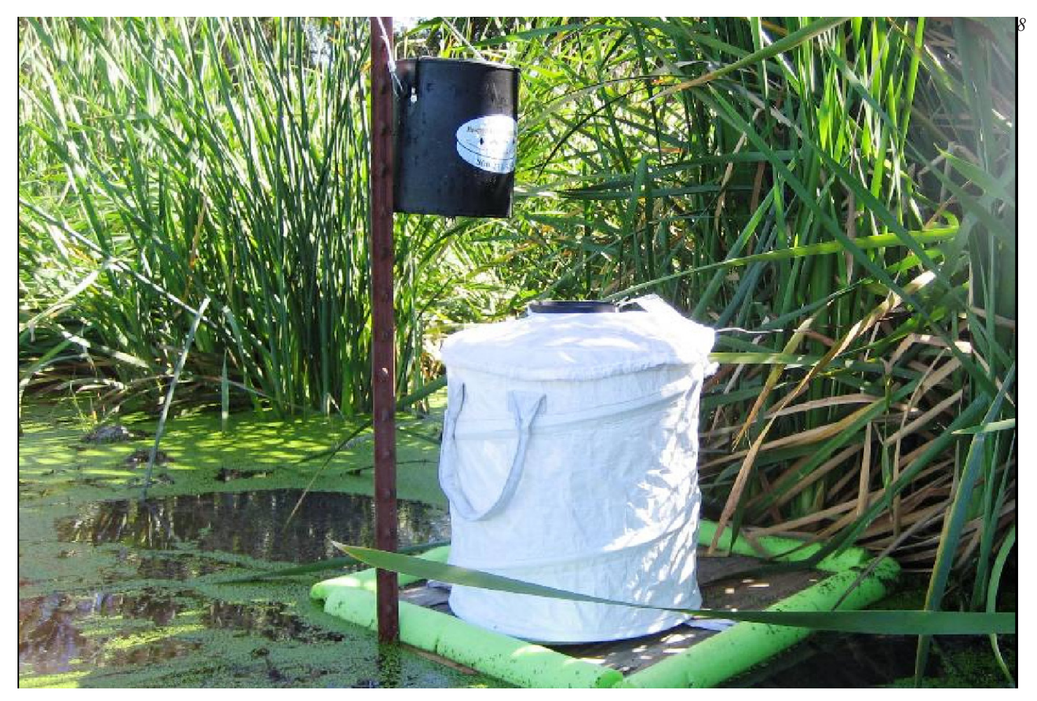
Figure 1. BG Sentinel trap at Rio Lindo waste pond.

road which circumvented the pond, and one EVS trap was hung on a cat walk above the pond. The three sentinel traps were placed on floating stations directly in the pond; two were located deep within the cattails (Fig. 1) and one in the open in the middle of the pond. All traps used dry ice placed in buckets above the trap and were set overnight to be collected early the next morning. The traps were monitored once a week for two weeks and then daily one week prior to the trial. Wild caught female Cx. pipiens were collected at the site and used in the bioassay cages of both trials at this location.