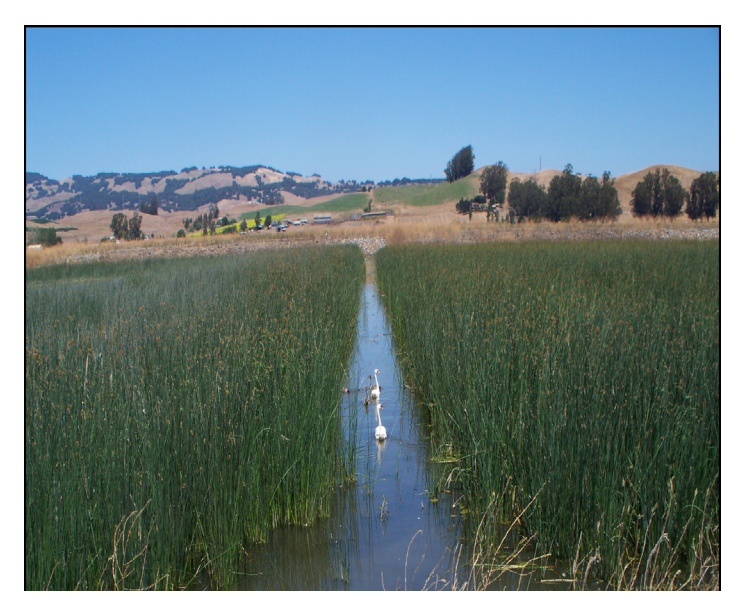
Figure 3. Petaluma waste water treatment facility pond covered with bulrush.